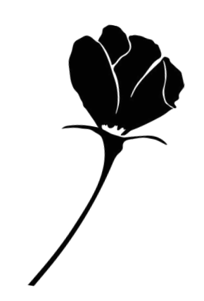
THE 2 TIMOTHY CHALLENGE LETTERS TO LEAD BY